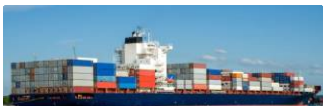
Sino-Global Signs MOU with Yunnan Jingyifeng Supply Chain Management to Address Growing Need for Exported Fuel and Agricultural Products to China