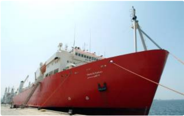
Wärtsilä solutions selected as E-Marine upgrades its fleet