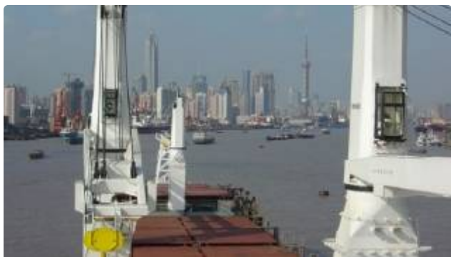
MacGregor receives USD 11 million crane order for general cargo ships