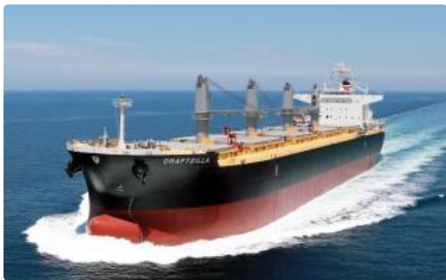
MES delivers 66,000 DWT type bulk carrier to Bronze Maritime