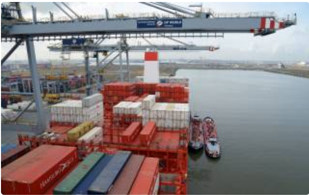
Port of Antwerp - Exceptional growth in reefer segment