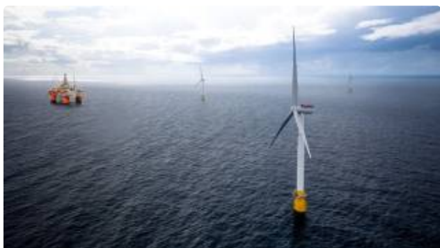
Lloyd's Register wins design contract at Hywind Tampen